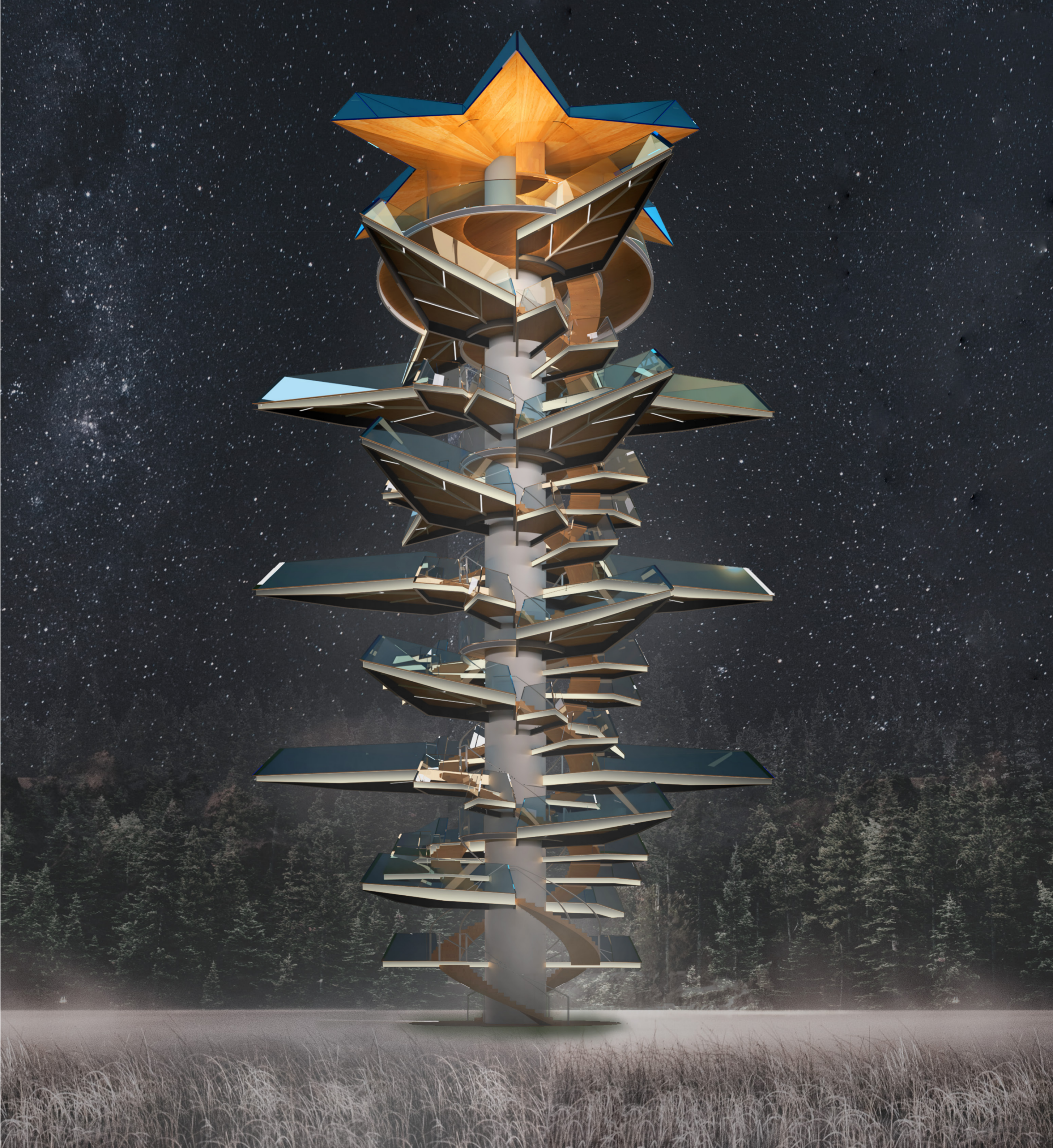
SMALL LEAVES Private Observation Platform